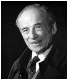
Pictured: Benjamin Graham, father of value investing.