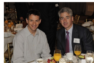
Bill Ackman and David Einhorn at the G&D Breakfast, 2010.