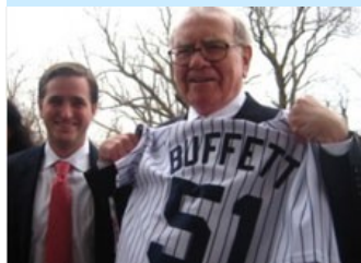
Investor Warren Buffett receives a gift from students on a Heilbrunn-sponsored trip in March 2008.