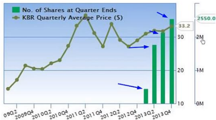
Quarterly Buys and Sells in the Last 5 Years: