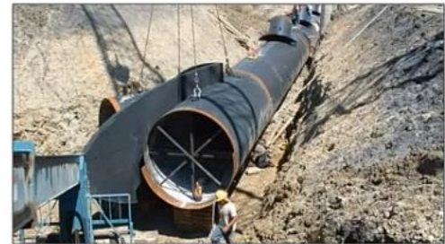
Water Pipeline (Texas)