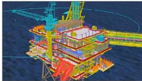
Drilling Rig (Denmark)