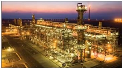
LNG facility (Egypt)